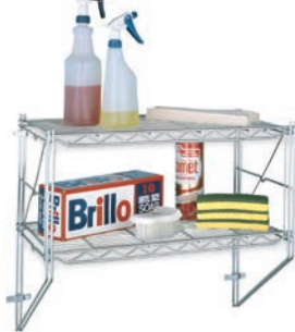
Erecta Shelf Wall Kit Two Shelf - 12" x 24"

FREE Erecta Shelf Wall Kit when you buy 2 Mightylite Pan Carriers